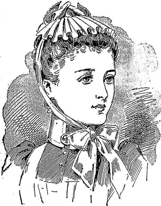
"Sister Victoria" Cap.

ARE PREPARED AT ALL TIMES TO GIVE ESTIMATES FOR HOSPITAL UNIFORMS, CLOAKS, VEILS, BONNETS, CAPS, APRONS, CUFFS, AND OTHER REQUISITES.